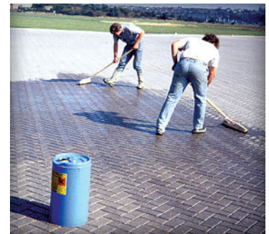
Figure 10. Urethane is applied with squeegees to stabilize joint sand between pavers on aircraft pavement.

If the base under the pavers drains poorly, the sealer is applied to saturated sand in the joints, or is applied too thick, the sealer can become cloudy and diminish the appearance of the pavers. In this situation, the sealer must be removed or re-