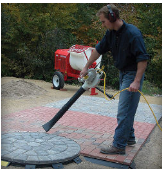
Figure 6. Whether using liquid or dry joint stabilization materials, the surface of the pavers should be cleaned with a blower or broom after the joint sand is compacted into the joints.

These are water or solvent-based with the primary resin or bonding agent being an acrylic, epoxy, modified acrylic, or other polymers as solids (by volume) typically 18% to 28%. Solvent or water carries the solids into the joint sand. They will