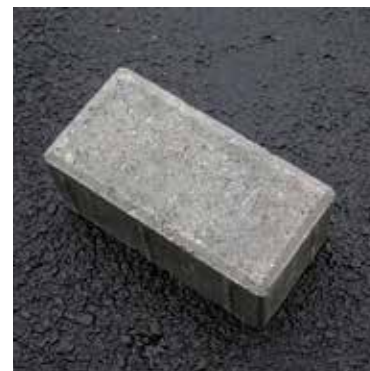
Figure 4. Spacer bars are small nibs on the sides of the pavers that provide a minimum joint spacing into which joint sand can enter.

A key aspect of this guide specification is dimensional tolerances of concrete pavers. For length and width tolerances, ASTM C936 allows \pm 1/16 in. ( \pm 1.6 mm) and CSA A231.2 allows \pm 2 mm. These are intended for manual installation and should be reduced to \pm 1.0 mm (i.e., \pm 0.5 mm for each side of the paver) for mechanically installed projects,