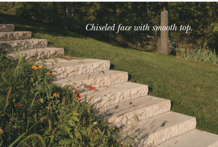
Chiseled face with smooth top.