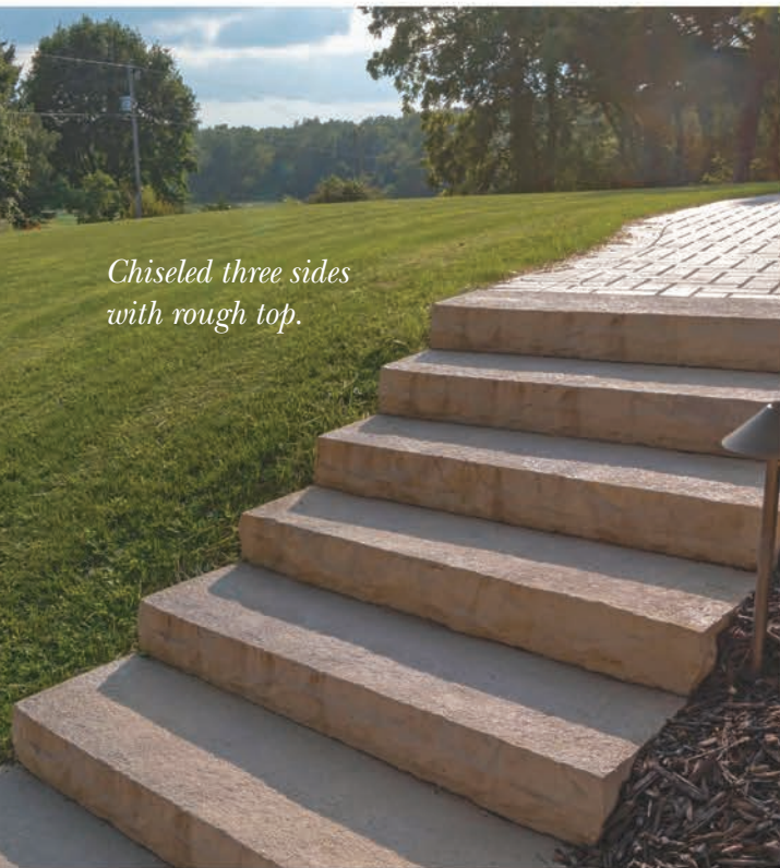
Chiseled three sides with rough top.