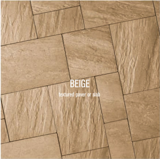
BEIGE textured paver or slab